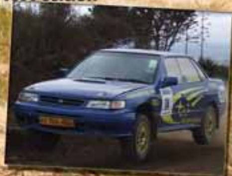
Mubin Sumra in action 3rd Position